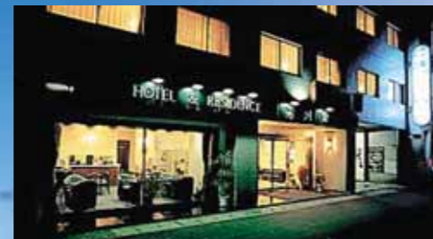
Be located in the center of the city & the main area of sightseeing