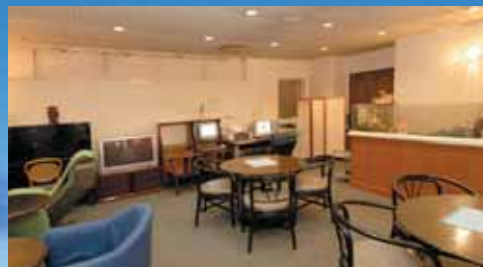
Windows, Mac & internet are available