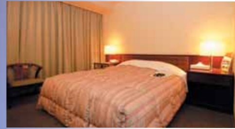
Queen size double bed Deluxe Double Room (160×190cm : 22㎡)