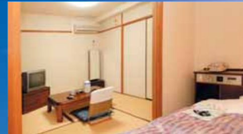
Long-staying accommodation rental package Long-Staying residence of hotel room

Triple Room & Fourth Room JPY¥13,500 (tax inclusive)~