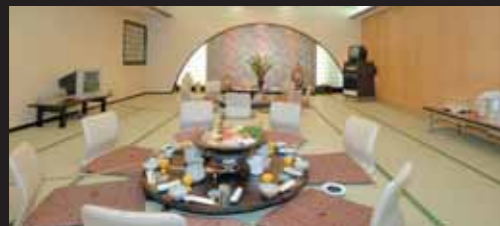
Maximum capacity for 40 people