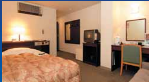
Wide bed & space Semi Double Room (120×190cm : 19㎡)