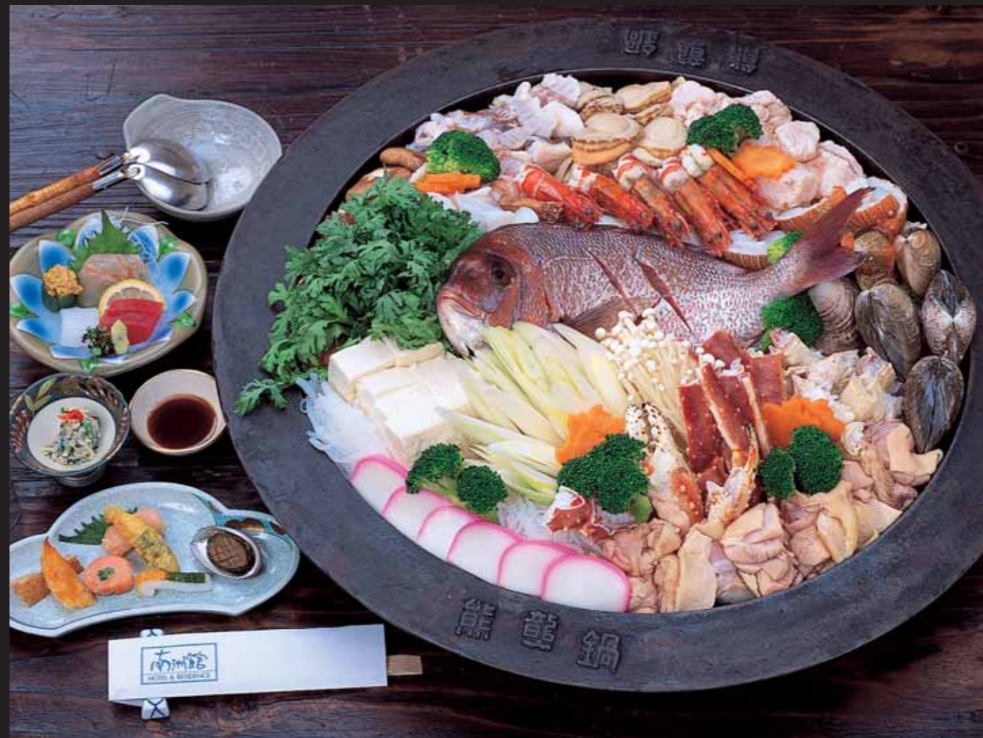
Kagoshima Traditional Kumaso-nabe ( for 8 people set meal)

The 70cm big black ironical pot that origin of the Satsuma ancestors in the Kumaso-nabe myth has made its grand come back again. Starting with luscious seafoods & vegetables from Kagoshima and taking great pleasure in taste of the special make congee last