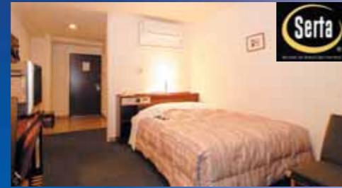
Looking for good and healthy of your sleep Double Room (140×190cm : 20㎡)