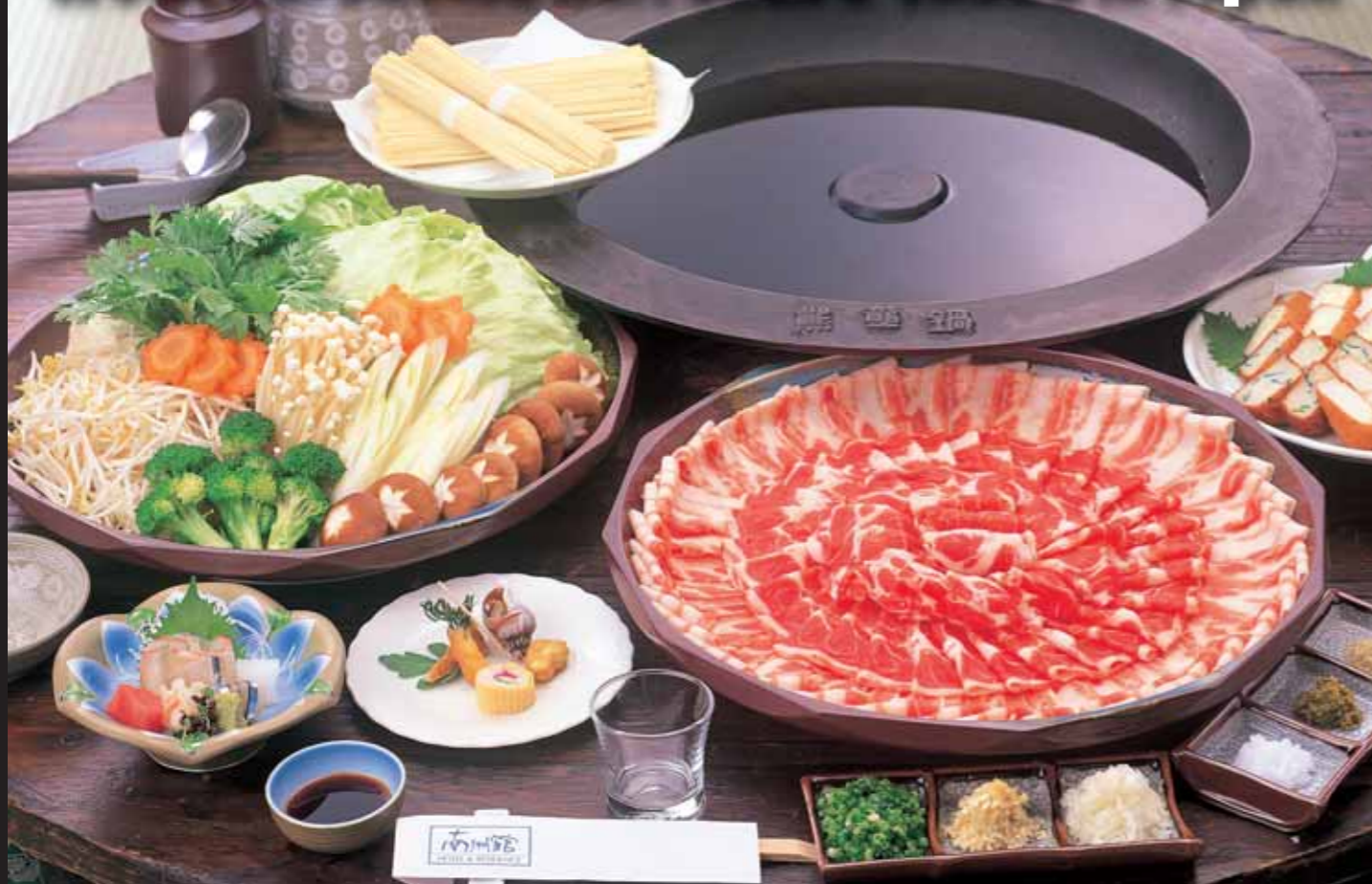
Special Select Kagoshima Berkshire pork shabu-shabu course meals ( for 8 people set meal)