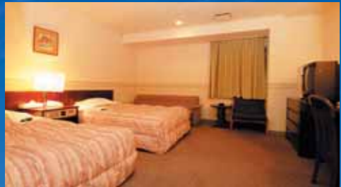
Correspond with different kind of needs Twin Room