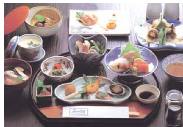
JPYY5250 set meal

The First of Local Production for Local Consumption Promotion shop in Kagoshima